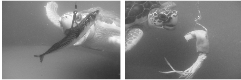
Figure 2 Observations of foraging captive turtles indicate that fish bait tends to come free of the hook while being progressively eaten by the turtle in small bites, while squid bait holds much more firmly to the hook and tends to result in more turtles consuming the hook with the squid. More research is needed.