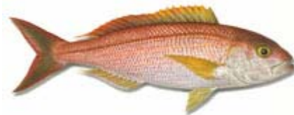
Opakapaka, pink snapper ( Pristipomoides filamentosus )