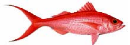
onaga, or ula`ula koa`e ( Etelis coruscans )