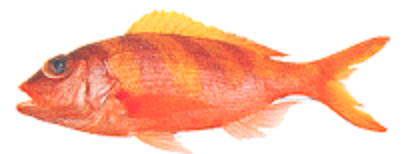
Gindai ( Pristipomoides zonatus )