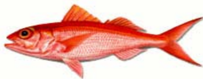
onaga, or ula`ula koa`e ( Etelis coruscans )