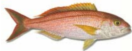
Opakapaka, pink snapper ( Pristipomoides filamentosus )