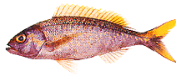
Kalekale ( Pristipomoides auricilla )