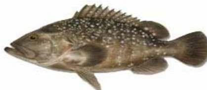
Hapu`upu`u ( Epinephelus quernus )