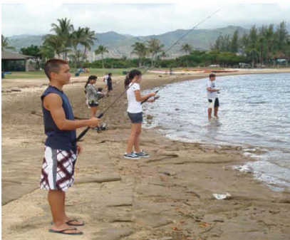
Respect users who are there first

In ancient Hawaii, everyone understood the papa kanawai kai , the rules and correct ways to behave on the ocean.