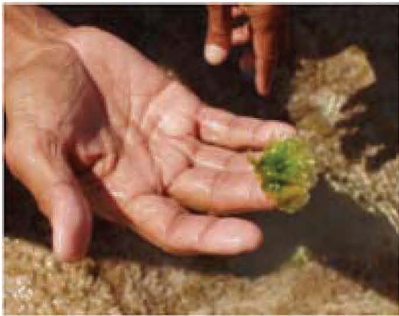
Leave the roots

Waikiki Aquarium, 2777 Kalakaua Ave., Honolulu