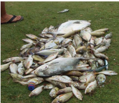
Share your catch!