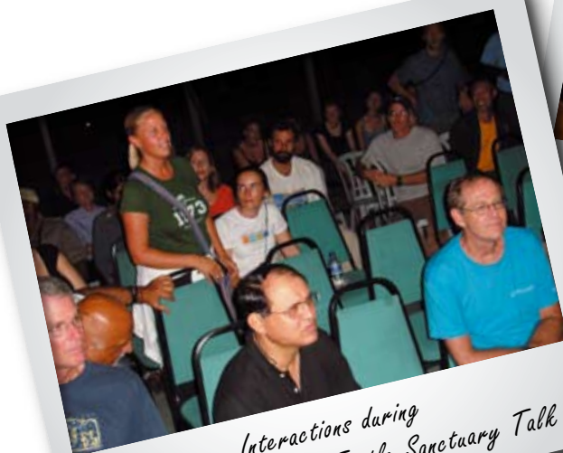
Interactions during the Ma'Daerah Turtle Sanctuary Talk