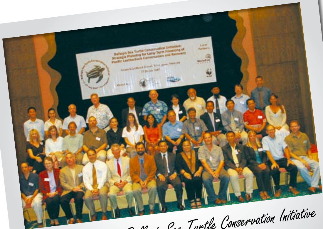
Participants of the Bellagio Sea Turtle Conservation Initiative July 17-20 2007, Terengganu, Malaysia.