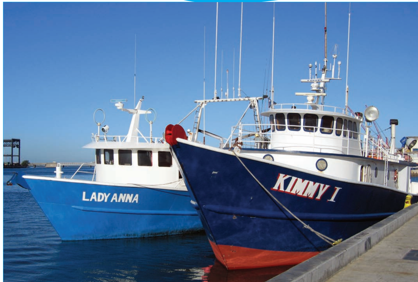
The Hawaii longline fishery is 93 percent compliant with the UN Food & Agriculture Organization's Code of Conduct for Responsible Fisheries and serves as a model for longline fleets elsewhere in the Pacific.