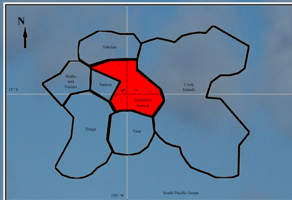
U.S. Exclusive Economic Zone (EEZ) American Samoa