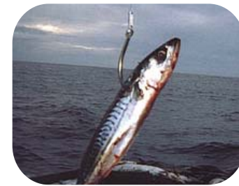
Using fish as bait instead of squid provides additional protection to keep turtles off hooks.