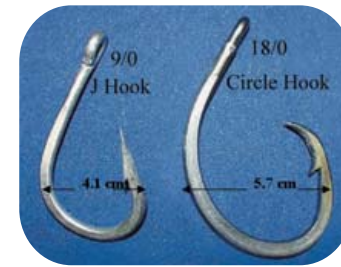
The larger the hook, the less likely a turtle will be able to swallow it. Circle hooks result in less lethal hookings, and reduce interaction rates with turtles while maintaining target catch rates.