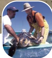
Left: Sea Turtle Association of Japan, helping an injured loggerhead nest. Right: ProCAGUAMA team members, Baja California, Mexico, collecting information on foraging habitats utilizing a turtle outfitted with satellite transmitter.