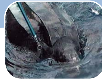
Operators of Hawaii-based longline vessels must carry and use dehooking devices to remove gear and release incidentally caught turtles.