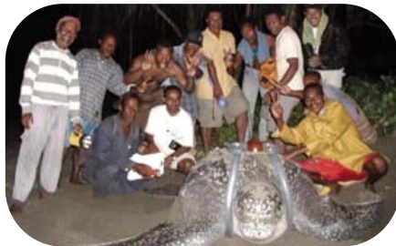
Left: Local community members collect data and monitor nesting beaches in PNG and Indonesia. Right: Kamiali community, Papua New Guinea, deploying satellite telemetry to collect migratory information.