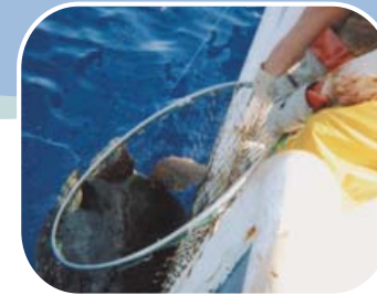
Proper handling can significantly reduce mortality.