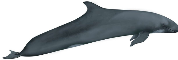
Figure 1–1. Biological illustration of a false killer whale. © NOAA Fisheries 2016

On November 28, 2012, after considering the best scientific and commercial data available, we published a final rule to list the MHI IFKW as an endangered DPS under the ESA (77 FR 70915) (Figure 1–1). This final rule became effective on December 28, 2012.