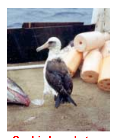
Seabird ready to be released