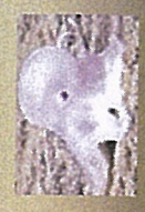
'Casper' the Octopod @ 4290 m →