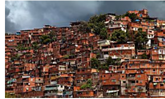
12 Most Dangerous Cities in The World to Travel Promoted By DailyForest