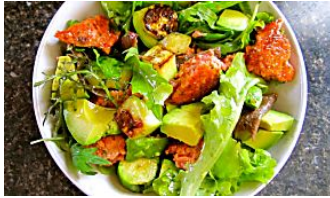
6 Super Fast Salmon Recipes Promoted By Awesome Cooker