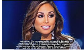
After tough question in finals, Miss Hawaii USA gets the last laugh