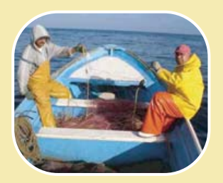
Fishers deploying experimental gillnet in hopes of finding realistic solutions to the bycatch problem.