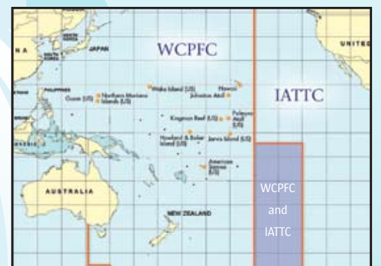
Jurisdictional areas of the international Western and Central Pacific Fisheries Commission (WCPFC) and Inter-American Tropical Tuna Commission (IATTC). Orange dots indicate where fisheries are managed by the Western Pacific Regional Fishery Management Council.

About 400 US albacore trollers, based at West Coast ports, fish in the North Pacific and land about 12,000 to 14,000 mt. Some vessels from this fleet fish seasonally for albacore in the South Pacific, catching up to 1,500 mt.