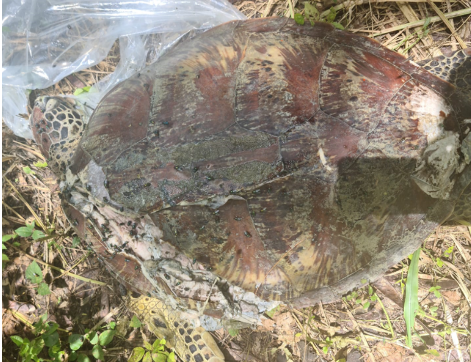
Figure 8. Carapace of green turtle struck by a vessel and retrieved on Sept. 2.