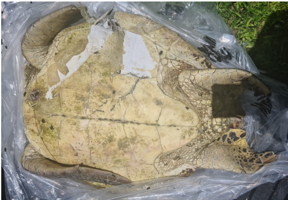
Figure 9. Plastron of green turtle struck by a vessel and retrieved on Sept. 2.