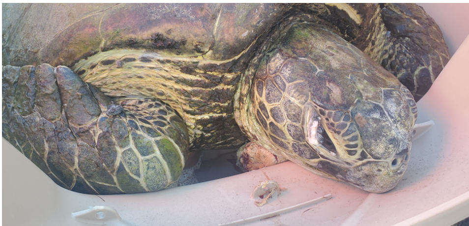
Figure 11. Green turtle captured on November 4 th , with FP-like tumors under its neck.