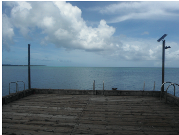
Figure 4. Merizo pier, with recent vandalism to the solar lights.

Update: The two (2) projects are currently at the Department of Public Works for bidding. Agriculture will be requesting for additional funding to replace the worn-out sections of the Merizo boat ramp. The scopes of work have been revised, and DPW should be moving forward with the projects. The pier's repair work includes replacement of the solar lights, two of which were stolen during the time period. The repair and assessment projects are expected to be completed in FY2022.