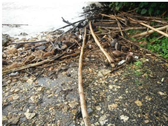
Figure 1. Talofofu Boat Ramp proposed shoreline site

Update: GEDA is still working on completing the Design-Build Request for Proposal (RFQ) Package for the proposed ramp at Talofofu Bay. Once finalized, funding will have to be allocated for the project.