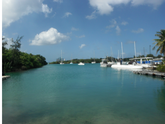
Figure 3: Harbor of Refuge site

Merizo Pier and Boat Ramp Facility. Contractual work is being proposed to repair damage at the Merizo pier and boat ramp facility and to assess the pier for structural integrity (see Figure 4). With the required MOU in place, a Scope of Work was submitted to the Department of Public Works.