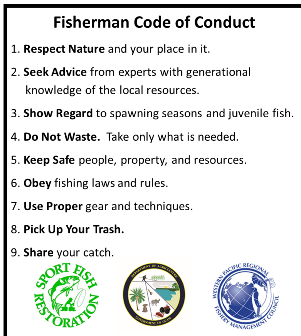
Figure 7. Fisherman Code of Conduct Signs

No update: The biologist coordinating the fishing platform transferred to a federal position. DAWR will be assigning another individual to coordinate the project.