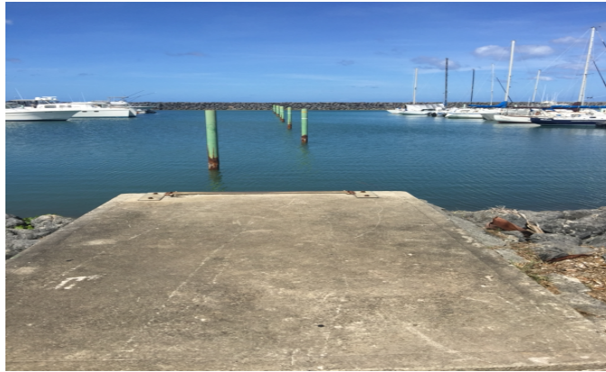
Figure 2. Site of Dock B with damaged decking removed.

Harbor of Refuge. Agriculture is assisting the Port Authority of Guam (PAG) with the repair of the Harbor of Refuge. The facility currently does not meet Coast Guard standards, with the moorings and concrete anchors needing replacement. Agriculture is using its Boating Infrastructure Grant Tier 1 funding to fund 75% of the repair work and provide a pumpout station for transient boaters. To qualify for BIG funding, 75% of the Harbor of Refuge’s moorings will be set aside for transient vessels to use. DAWR received five (5) BIG awards, with most of the funding to be subawarded to the Port. The total amount of all the BIG Tier 1 awards is $900,000.