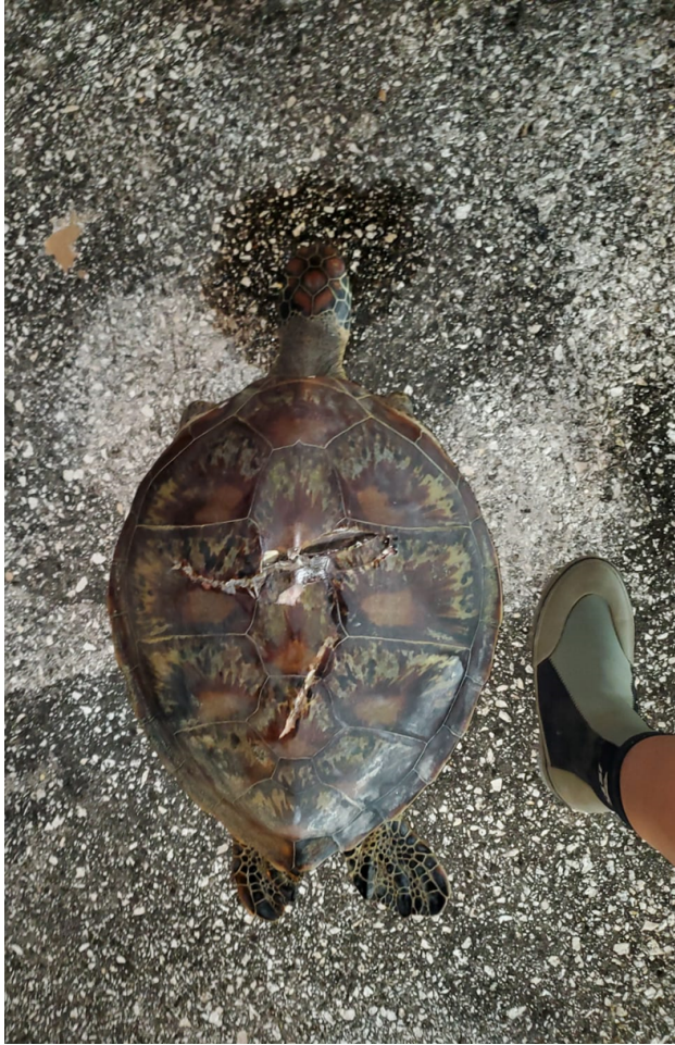
Figure 10. Carapace of the green turtle struck by a vessel and retrieved on Sept. 16.