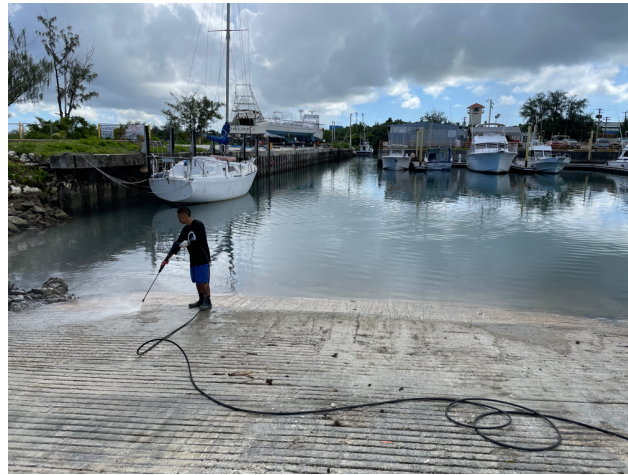
Figure 5: Fisheries staff water blasting the back ramp at the Agana Boat Basin.

The repair of the ramps' walkway bumpers at the Agat marina is currently ongoing. With the Amended MOU approved by the AG mid-August and a conditional NTP given by WSFR mid-September, PAG is in the process of finalizing their statement of work and issuing an Invitation to Bid.