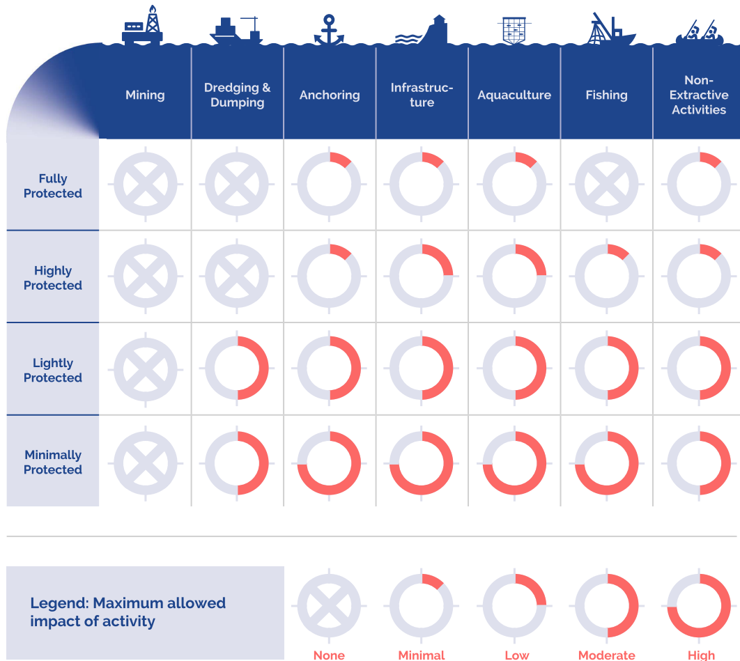
Fig. 1. Level of protection based on maximum allowed impact of seven potential activities in MPAs. An MPA or MPA zone can be categorized into one of four LEVELS of protection: Fully, Highly, Lightly, or Minimally, on the basis of seven types of activities and their impacts (a decision tree approach is available in fig. S2). Dials indicate the scale of impact that may be occurring at a given protection level: none, minimal, low, moderate, or high/large. If impacts are high/large, the

duration, and frequency relative to biodiversity conservation goals and is described as “none,” “low,” “moderate,” “high/large,” or “incompatible with biodiversity conservation” (Fig. 1 and fig. S2). Using this impact scale, a LEVEL of protection can be assigned for any given MPA or zone regardless of location, species, or circumstances. Impacts of certain activities may scale differently considering specific features of an MPA or zone, such as size; for example, distribution of an activity across areas of different sizes may render it high impact in a smaller MPA but moderate impact in a larger MPA. Incompatible activities include industrial extraction such as industrial fishing (for example, vessels > 12 m using towed or dragged gears), oil and gas exploration, mining, or other extremely impactful activities such as fishing with dynamite or poison (supplementary materials, LEVELS Expanded Guidance,