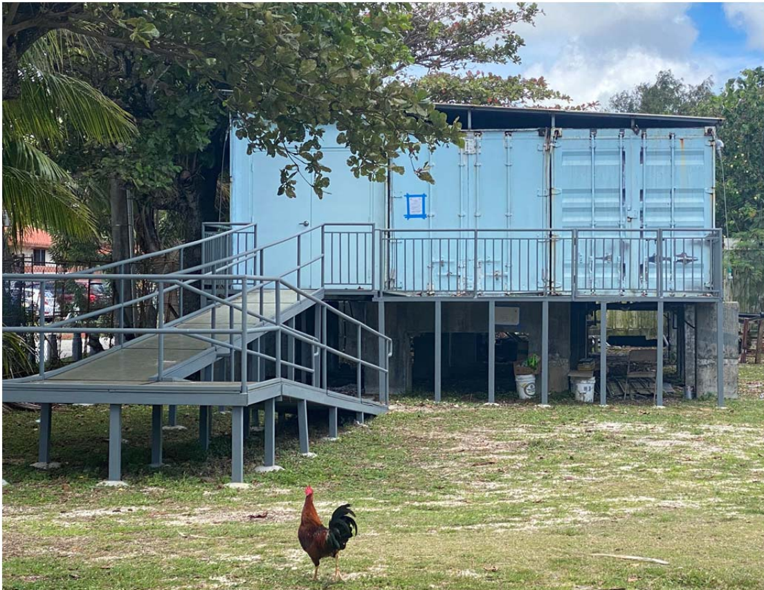
Guam Fishermen's Coop Temporary Facilities