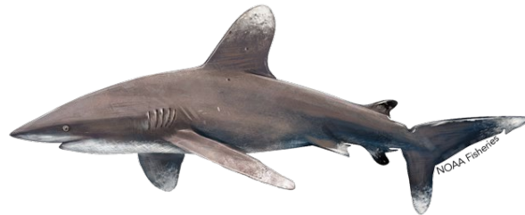
Figure 1. Oceanic Whitetip Shark

On January 30, 2018, after considering the best available scientific and commercial information, we listed the oceanic whitetip shark ( Carcharhinus longimanus ) as a threatened species throughout its range (83 FR 4153). The final rule became effective on March 1, 2018.