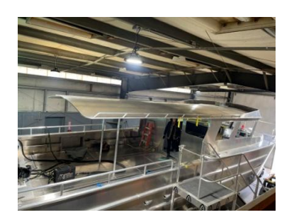
Length over All (LOA) 38'x14'

Here are some pictures taken during the inspection visit. The vessel will be ready in June/July 2023 according to the boat builder.