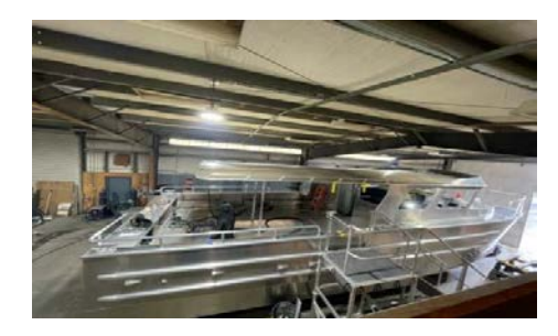
Deck area & roof & LOA