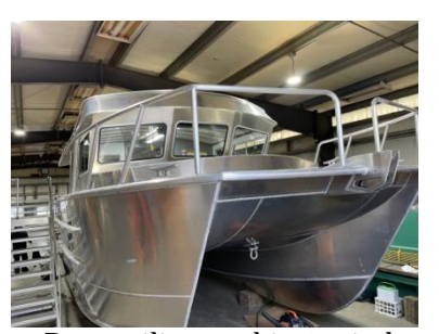
Bow, railings, cabin & windows