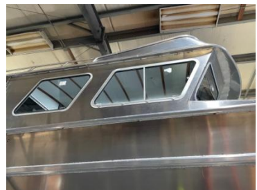
Outside of cabin & windows