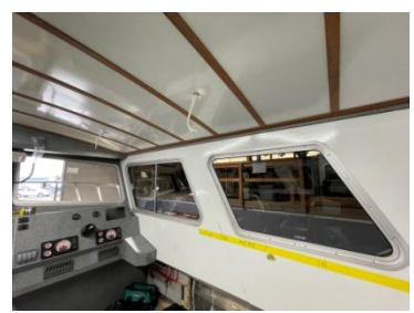
Inside cabin, windows & helm station & dashboard