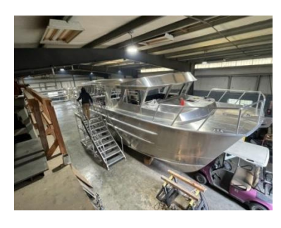
Cabin (cuddy) & side of bow