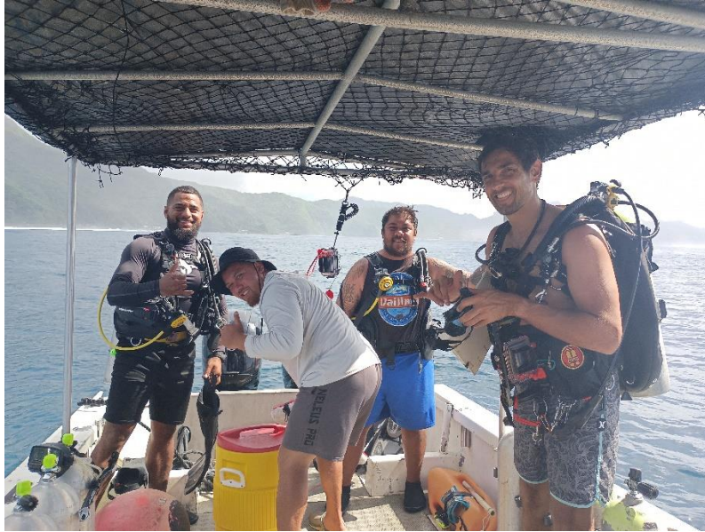
Staff conducting underwater coral reef monitoring.