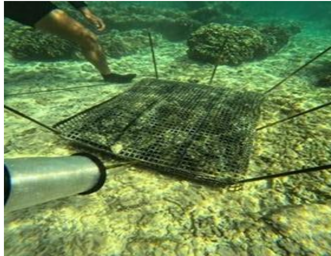
Placement of cage at date of deployment 12/1/2023