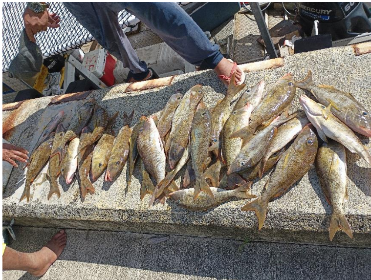
Collection of otoliths and gonads from an emperor fish.

Staff were able to collect 125 fish samples for this study. We were able to collect enough samples for Lethrinus amboinensis and scared oviceps. Team is continues to try and collect enough samples for the remaining 3 species for the upcoming otolith and gonads training in May 2024.