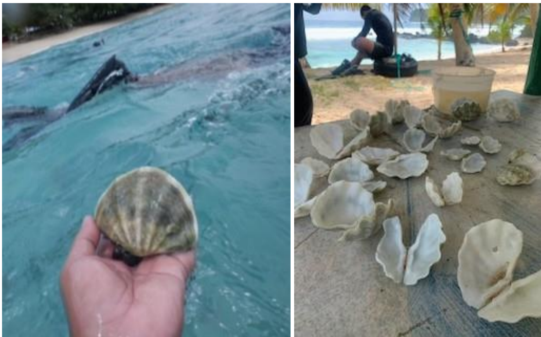
(L) Live clam located near deployment site: Dead clams found along the beach (R)

After searching for an approximate 3 hours on shore and underwater, the Fisheries team managed to collect 29 dead clams scattered across the beach and 5 live ones found underwater near the cage location. The rebars that stabilized the clam cage on the seabed were retrieved and neither the cage nor the trays were recovered. The 5 live clams were transported to the giant clam site in Faga’alu where they will be monitored and kept safe with the other 550 clams originally deployed in Faga’alu.