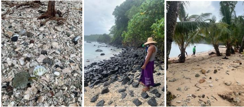
Dominant sites where dead clams were found

After searching for an approximate 3 hours on shore and underwater, the Fisheries team managed to collect 29 dead clams scattered across the beach and 5 live ones found underwater near the cage location. The rebars that stabilized the clam cage on the seabed were retrieved and neither the cage nor the trays were recovered. The 5 live clams were transported to the giant clam site in Faga’alu where they will be monitored and kept safe with the other 550 clams originally deployed in Faga’alu.