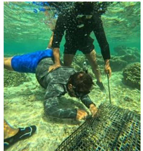
Last sighting of clam cage at monitoring date Friday, January 19th 202

Important note: Fisheries monitoring team checked on the clams the week before on Friday the 19th January on usual monitoring schedule (every 2 weeks since day of deployment) where the clams were cleaned and counted again; everything was observed to be set in place.