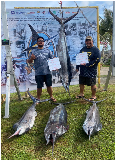
Small but many hookups

Ambros, Inc., the Budweiser distributor in Guam and in American Samoa, celebrated their 75 th anniversary by hosting a one-time fishing derby. Held on Saturday, September 14, the 75 th Ambros Inc. Fishing Tournament capped at 100 boats with up to $50,000 in prizes. For the first time in Guam, only the Agaña Marina was used. Kapena was the featured entertainment.