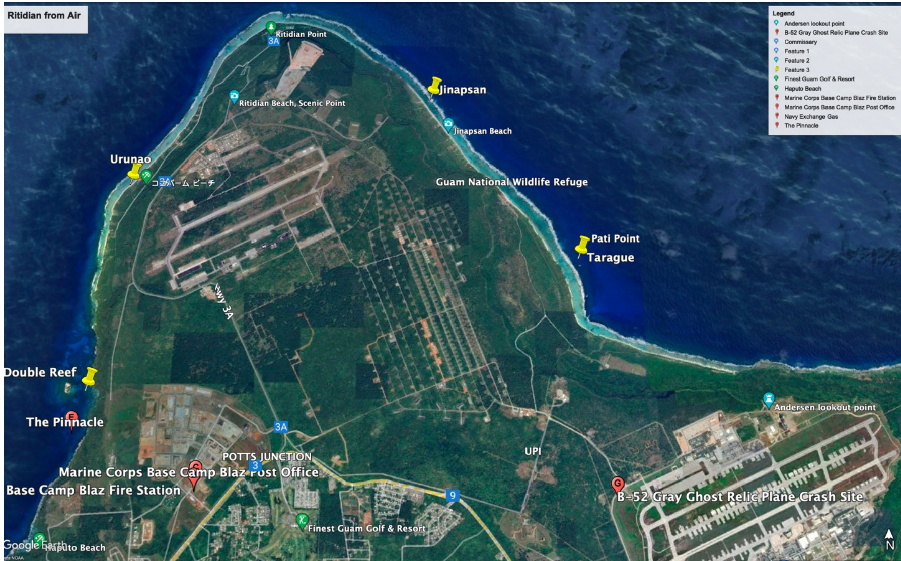
Ritidian Point with Northwest Field, Andersen Air Force Base and Camp Blaz