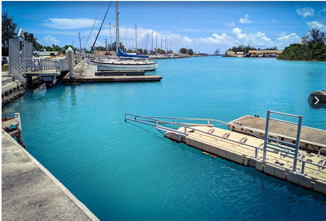
Sumay Cove Recreational Marina, Big Navy

The AP is actively pursuing mitigation measures with Joint Region Marianas to find ways to ensure the Guam fishing community is accommodated. It makes for a better partnership in good faith into the future.