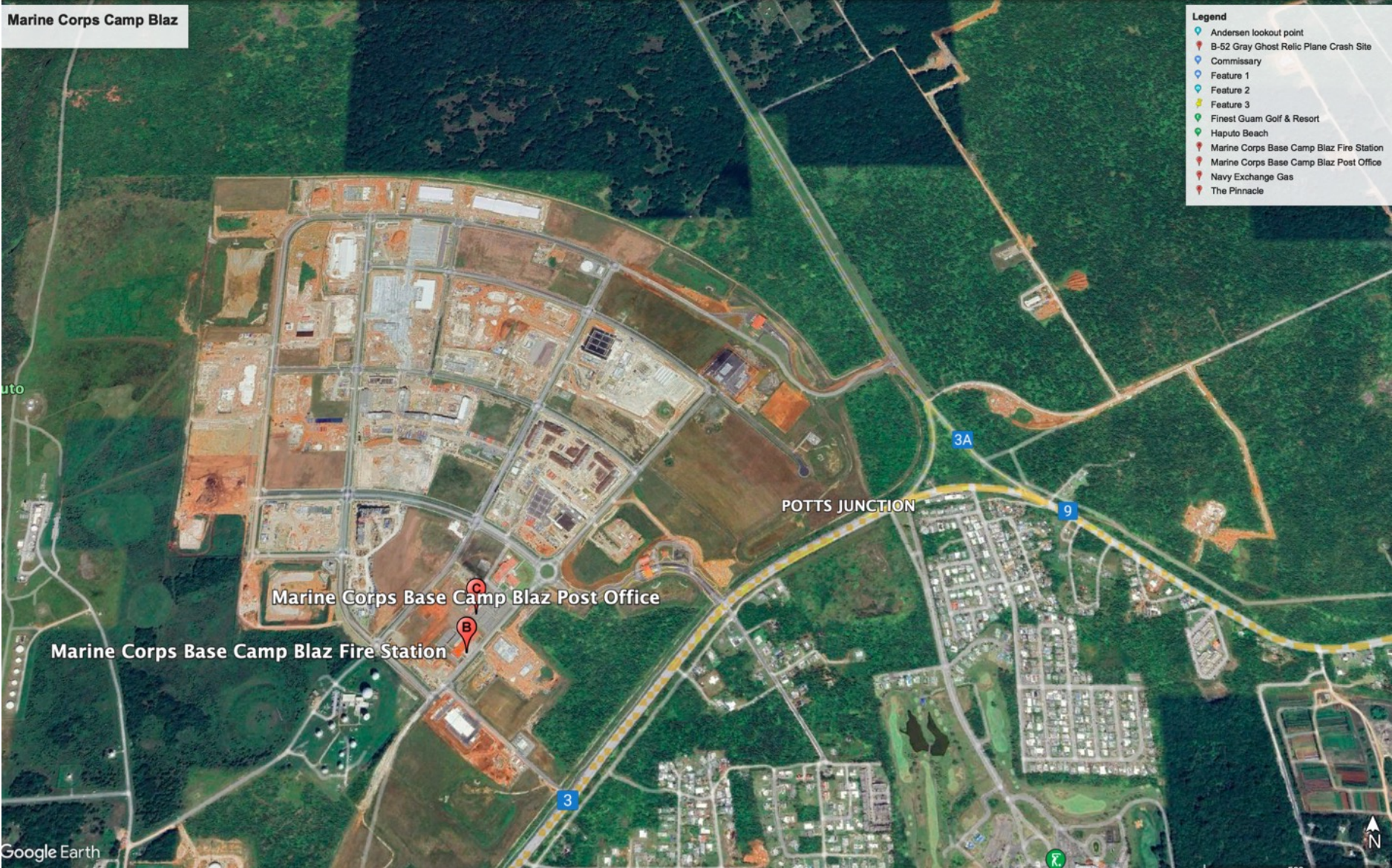
Marine Corps Base Camp Blaz under construction