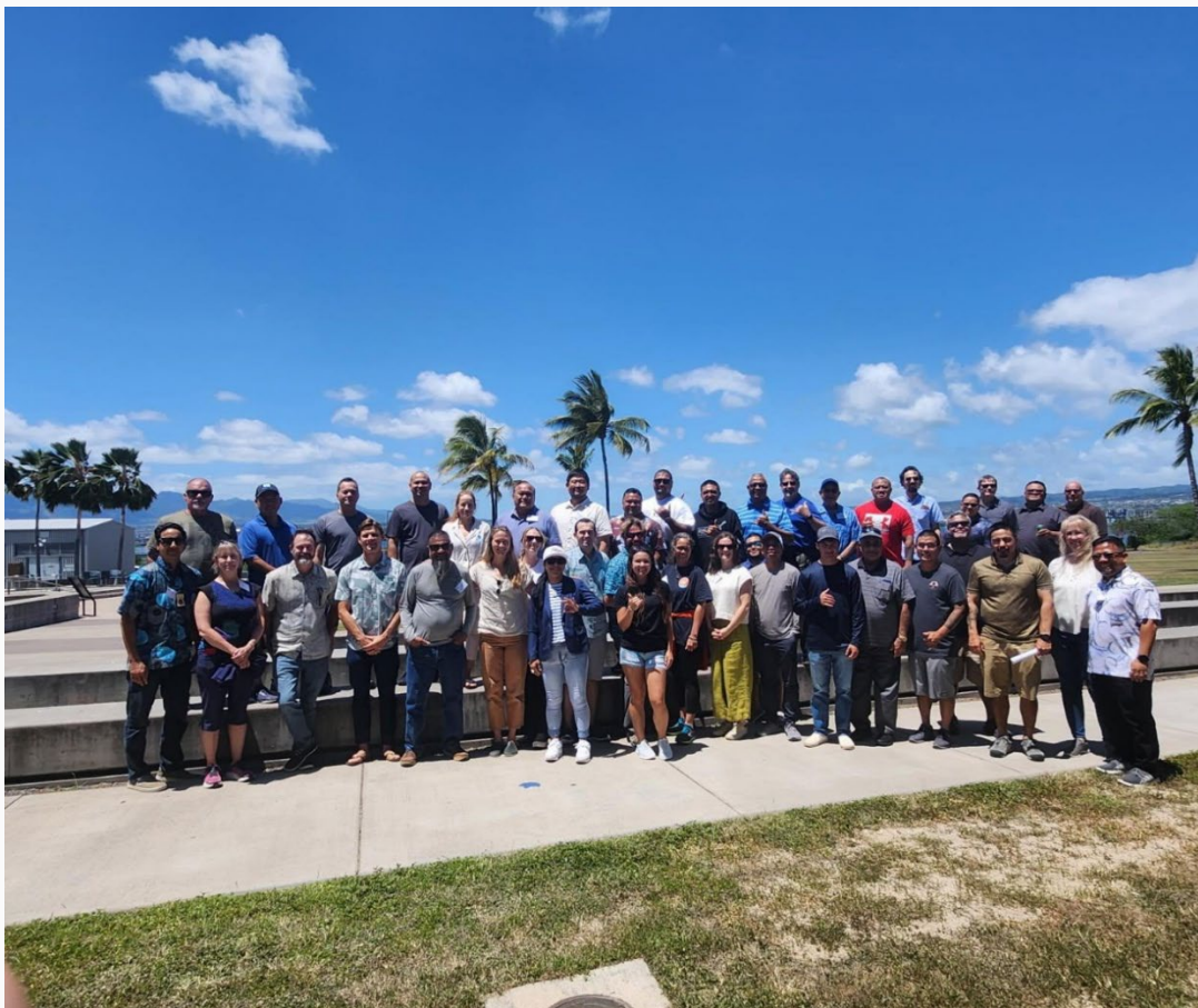
Pacific Islands Marine Resources Education Program participants at the NOAA Inouye Regional Center.